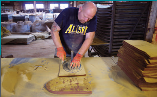
Bespoke tiles cut by hand

The natural qualities of clay, along with our traditional processes and specially developed firing techniques - where our tiles undergo a lengthy drying procedure before being fired to over 1000° Celsius - combine with sand facing to impart a unique character to our individually handmade roof tiles.