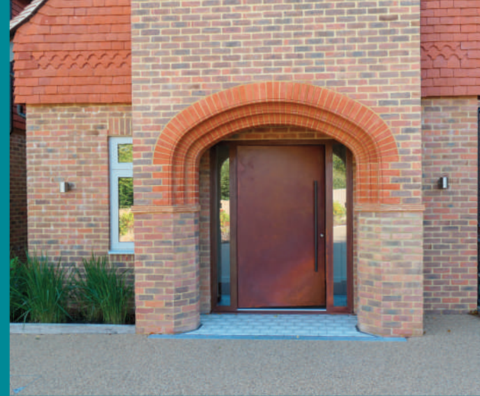
Discreetly positioned handmade clay Bat Access Tiles