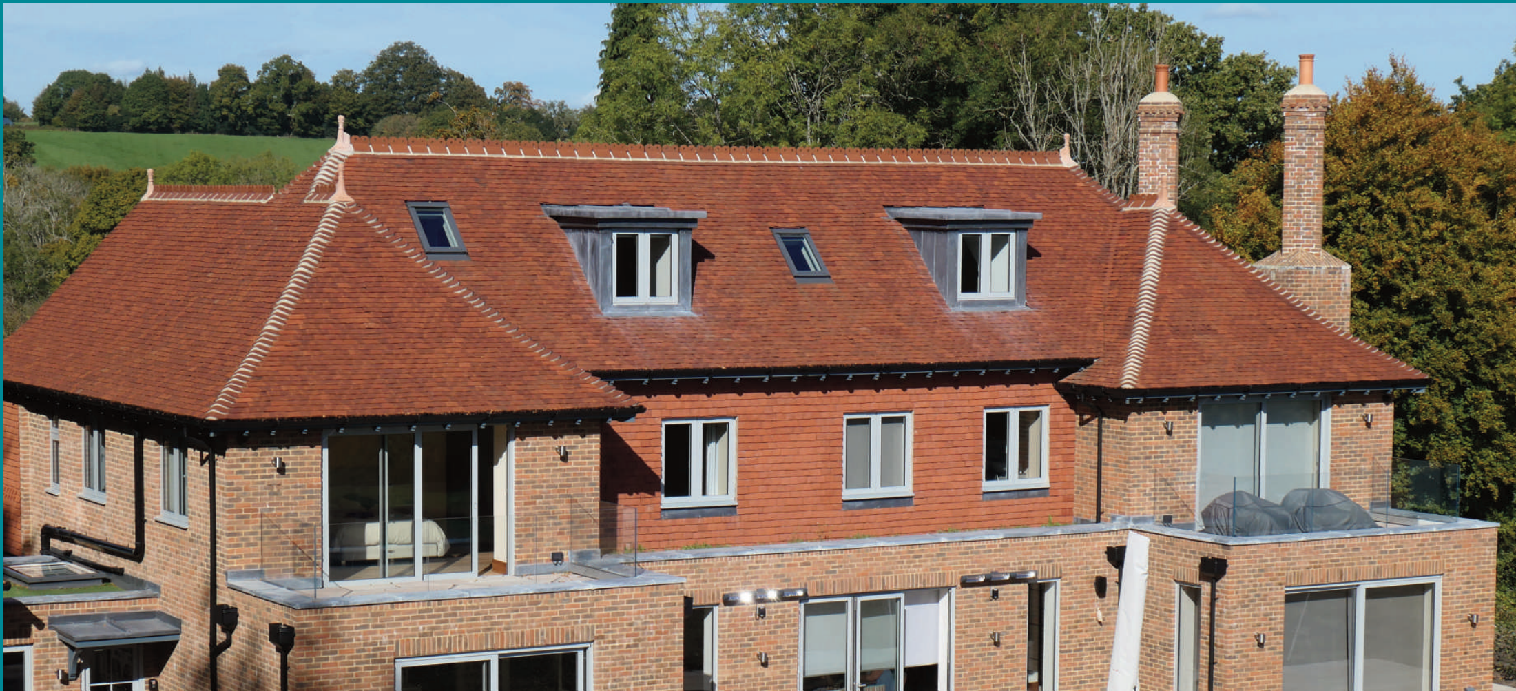
Roof tile mix- 80% Medium Antique, 20% Red, with Tile hanging- Sussex Red