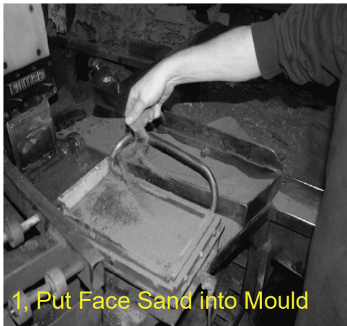
1, Put Face Sand into Mould