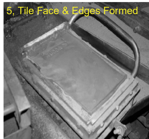
5, Tile Face & Edges Formed