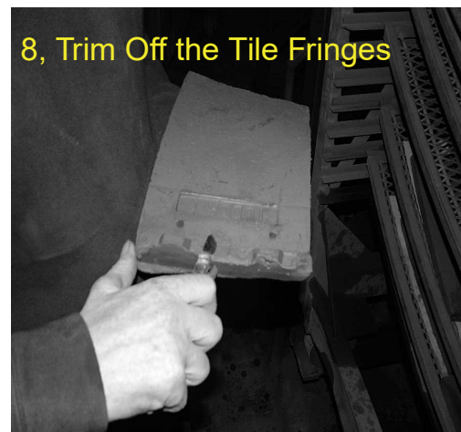
8, Trim Off the Tile Fringes

Tudor Roof Tile Co. Limited is based in Kent and is proud to be the largest independent manufacturer of handmade only clay roof tiles in the UK.