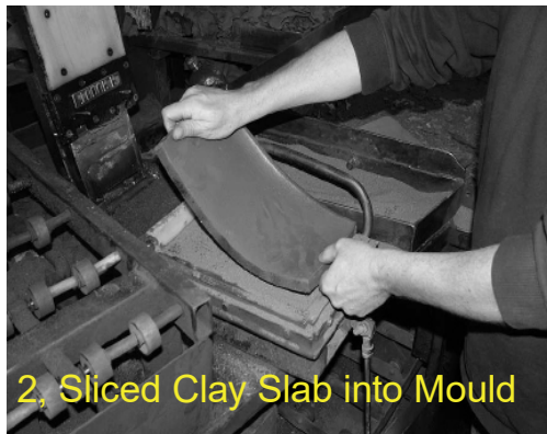
2, Sliced Clay Slab into Mould