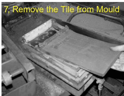
7, Remove the Tile from Mould