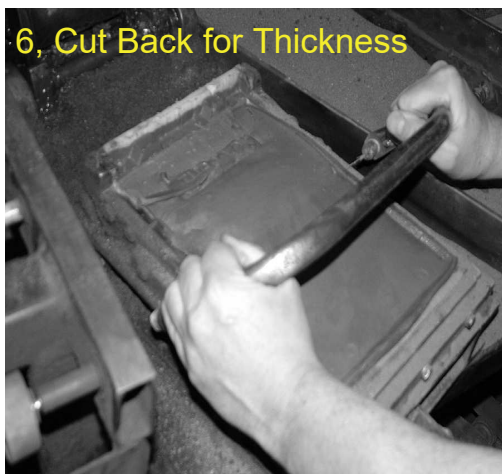
6, Cut Back for Thickness