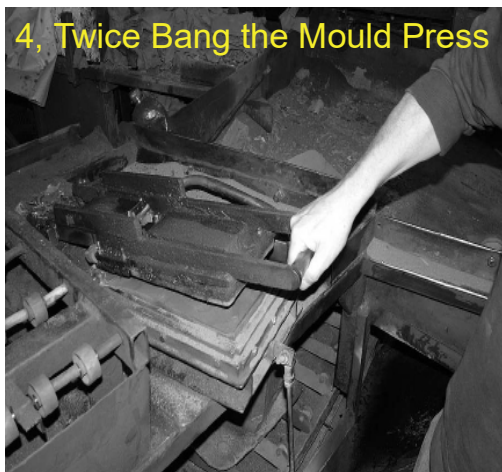
4, Twice Bang the Mould Press