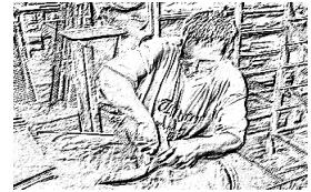
CRAFTSMAN by Tudor Tiles

The TRT In-Tile Vent is a low profile design, as manufactured in PVC-U by Ubbink Ltd. Each unit provides a free vent area of 6,250 mm 2 . Each unit is supplied with an adapter to enable the fitting of a standard 100/110 mm diameter flexible pipe, (optional extra).