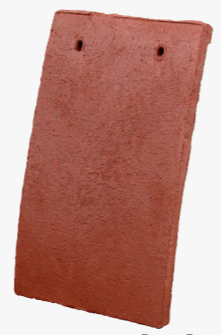
Natural Clay (no sand)